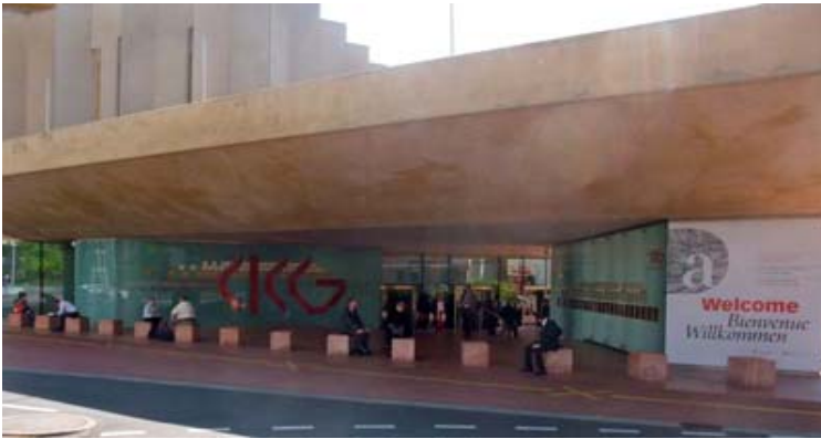
The conference premises in the Geneva congress center

The 8th European Conference on Digital Archiving was held in Geneva from 28-30 April 2010. By emphasizing digital elements and archiving as a function instead of the archive as an institution, it has taken a new approach. Almost 700 people not only from Europe but also from other parts of the world have partaken in the conference.