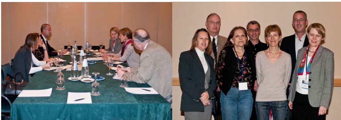
EURBICA Board during its meeting in Malta (November 16, 2009)

EURBICA Executive Board's two meetings in 2009 (in Malta) and 2010 (in Oslo) have resulted in several important decisions. A new statutes of EURBICA was prepared and it was disseminated to all members for discussion and for the possible proposals for its modification. Currently it is also available on ICA web page. In the frame of budget information it is important that EURBICA supported the 8 th European Conference on Digital Archiving in Geneva 2010 (ACE) with the whole regular funds for 2009 and 2010 – since EURBICA was also co-organizer with ICA/SPA.